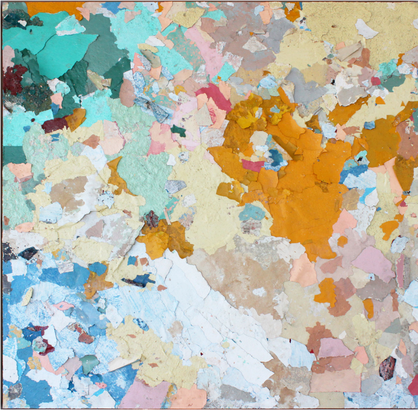
Diana Fonseca Quiñones, Untitled , from the series Degradation , 2017, paint extracted from exterior facades in Havana.

In conjunction with Material Detroit Cranbrook Art Museum will present the exhibition Landlord Colors: On Art, Economy, and Materiality . Featuring more than 60 contemporary artists from five international art scenes—Detroit, Greece, Korea, Cuba, and Italy—that have experienced economic and social upheaval over the last 50 years.