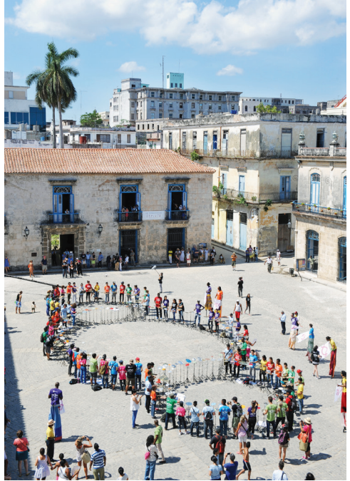
Michelangelo Pistoletto, Terzo Paradiso (Third Paradise), 2003–13, performance documentation, 346 cymbals, lids. Courtesy GALLERIA CONTINUA, San Gimignano / Beijing / Les Moulins / Habana.