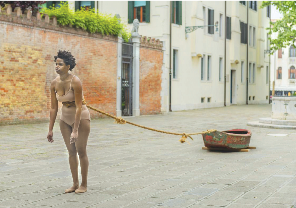
Susana Pilar, Dibujo Intercontinental (Performance, Biennale Venezia 2017), 2017, 1 channel video. Courtesy: the artist and GALLERIA CONTINUA, San Gimignano / Beijing / Les Moulins / Habana. Photo by: Oak Taylor-Smith.

PERFORMANCES CONVERSATIONS INSTALLATIONS