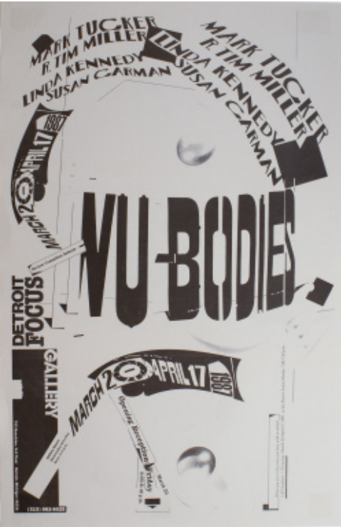
Edward Fella, Nu-Bodies ( Detroit Focus Gallery ), 1987 One-color, offset-print on bond paper

Create your own typography poster! Typography is the way that letters and words are designed and arranged in print. Take a look at Edward Fella’s typography poster!