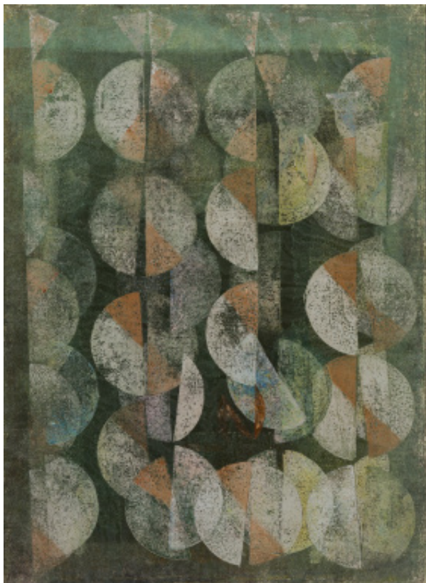
Harry Bertoia, Untitled Monoprint , 1943 Ink on Paper

What is a monoprint? Monoprinting is a form of printmaking that has lines, images or shapes that can only be made once, unlike most forms of printmaking which allows for multiple originals. Monoprints are truly one of a kind! Before we make our own monoprints, let's take a look at a monoprint made by artist Harry Bertoia!